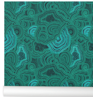
Large Scale Malachite wallpaper, $72 per 2' x 12' roll, spoonflower.com