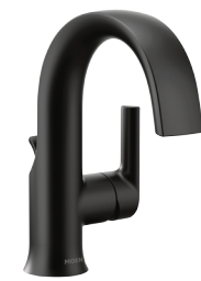
Moen Doux 8"-tall metal faucet in matte black, $417, build.com