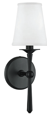
Hudson Valley Lighting Islip 14 3/4"-tall metal sconce in old bronze finish, $232, overstock.com

total mood Romantic—but make it modern, requested the Nashville, TN, homeowners. Designer Beth Haley had their vanity painted dark gray and the walls deep lavender (Soulmate by Sherwin-Williams), then mixed in black and brass finishes. “A faceted vase always adds sophistication,” she says.