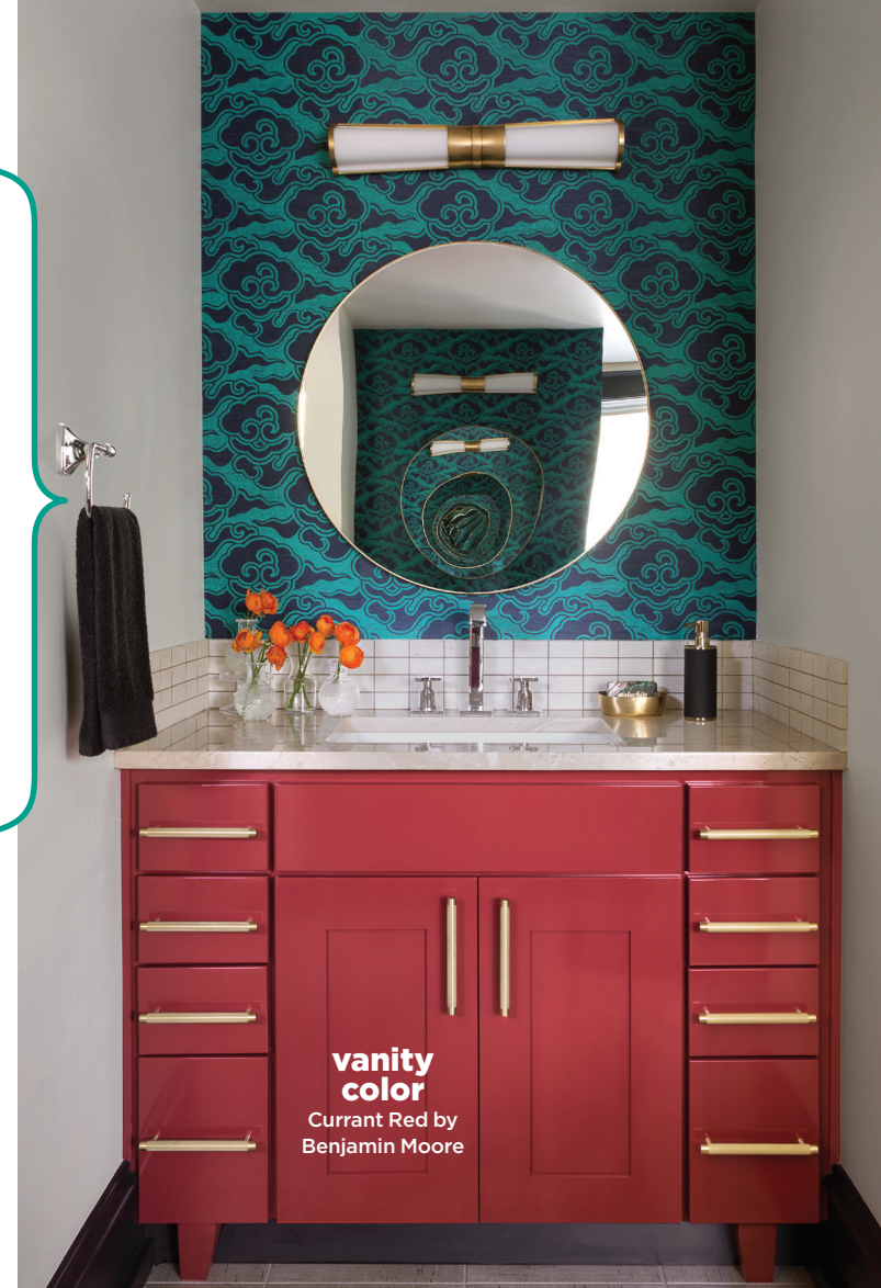
vanity color Currant Red by Benjamin Moore