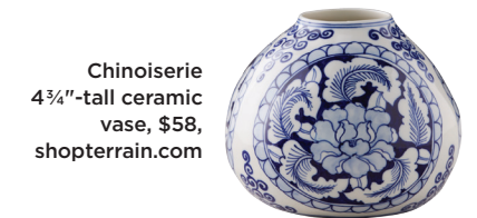
Chinoiserie 4 3/4"-tall ceramic vase, $58, shopterrain.com