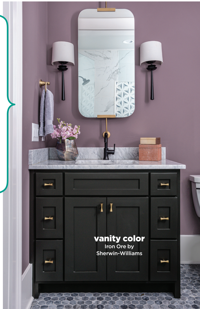
vanity color Iron Ore by Sherwin-Williams