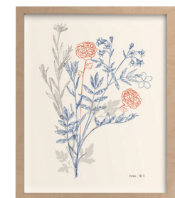
Flora Number One by Leslie Hamer 8" x 10" print with natural raw wood frame, $53, minted.com