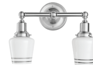
Irvine 13 1/2"-wide brass sconce in satin nickel finish, $299, schoolhouse.com

When you're sea-loving homeowners but you live in Phoenix, AZ, you don't want to go decor overboard. So designer Lexi Westergard went partly coastal and partly natural with a custom caned-front vanity and ocean-hued walls (painted Blue Heather by Benjamin Moore), plus botanical prints and a floral vase.