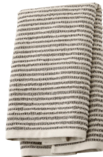
Rowan cotton hand towel in striped, $19, crateandbarrel.com